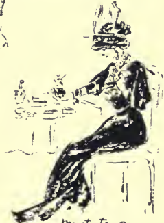
Must try on Every thing